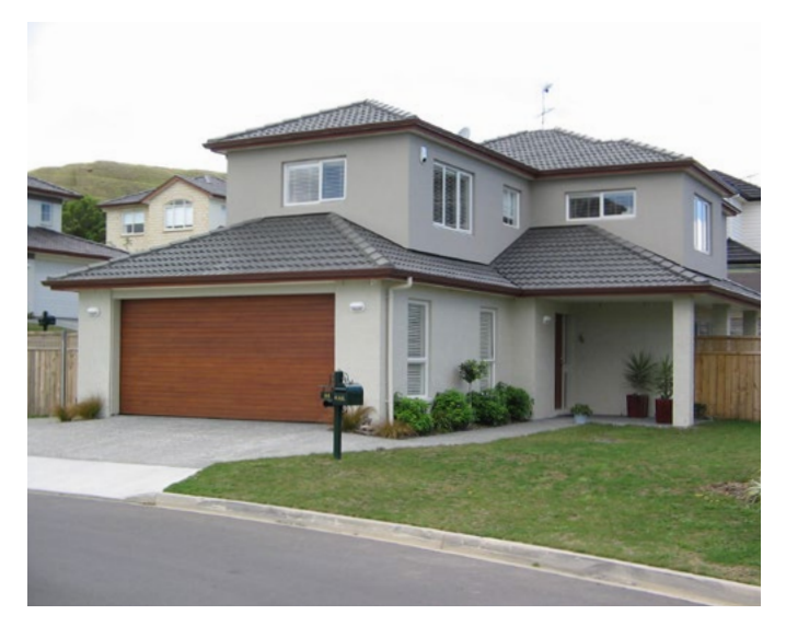
StoArmat Render System on Fibre Cement Sheet